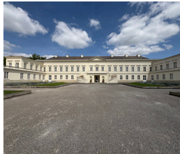
Schloss HerrenHausen in Hanover